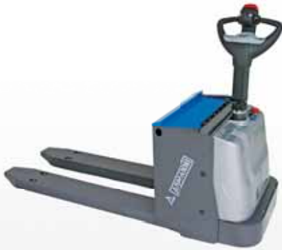
*Compact version for capacities up to 7 tons